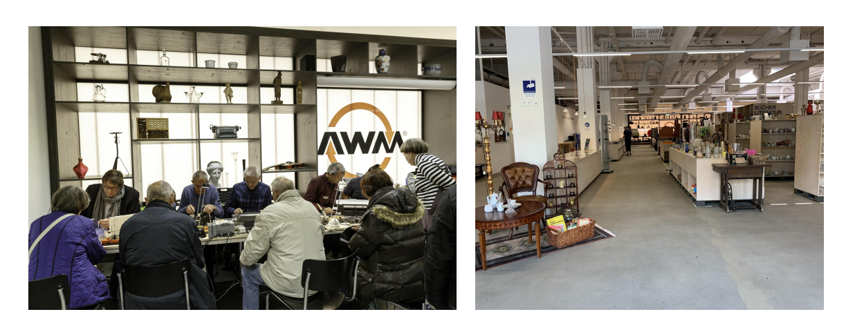
Picture 1 and 2: Halle 2 - Waste Management Corporation Munich (AWM)

but it is also used as a "reuse-lab" where AWM has created a knowledge platform for reuse ideas to flourish within the city. These include testing new awareness campaigns and methods to improve public relations, establishing repair cafés within the city, connecting stakeholders working within "sharing economy", the providing a space for upcycling workshops to increase local knowledge on how to prevent waste further and finally, presenting a number of cultural events for citizens to attend, such as fine art exhibitions, music performances, science conferences, lectures and many more.